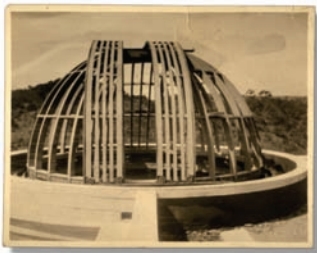
Mountain Boulevard Construction

Oakland Observatory was located in downtown Oakland and provided public telescope viewing for the community. For decades, it served as the official timekeeping station for the entire Bay Area, measuring time with its transit telescope. The observatory was given to the Board of Education in trust for the City of Oakland and was to be forever free to the public and public schools.