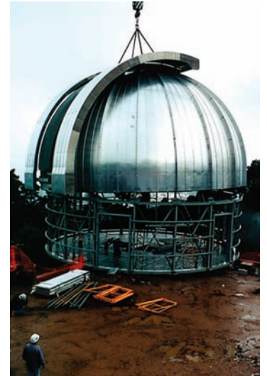
Dome being lowered during construction, 1998

Recognizing the need to restore full access to the facility, in 1989 Chabot Observatory & Science Center was formed as a Joint Powers Agency between the City of Oakland, Oakland Unified School District, East Bay Regional Park District and Eastbay Astronomical Society. In 1992 COSC was recognized as a nonprofit organization. The JPA reached an agreement to relocate to Roberts Regional Park high in the Oakland Hills. The project broke ground in October 1996 and construction of the new center began in May 1998.