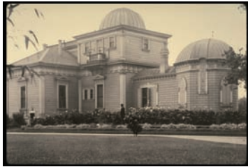
Lafayette Square Park

The institution began in 1883 as the Oakland Observatory, through a gift from Anthony Chabot to the City of Oakland. The original